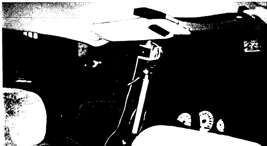
PHOTO 7: Panasonic WM-60AY capsule (used in Mitey Mike II) at driver's ear location.

8. Photo 7 shows the Mitey Mike capsule (Panasonic WM-60AY) positioned near the driver's ear location, within the vehicle.